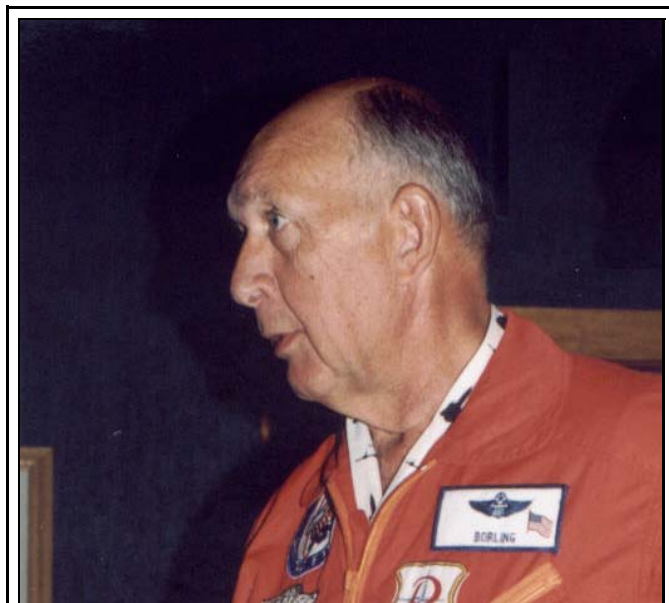
Gen. John L. Borling, candidate for U.S. Senate, discussed universal military service, Roe v Wade and other topics at TAPROOT's monthly breakfast-meeting, September 20, in Lombard.

An energetic senior citizen, running, push-ups every day, with two grown daughters, he seeks to help (See page 2)