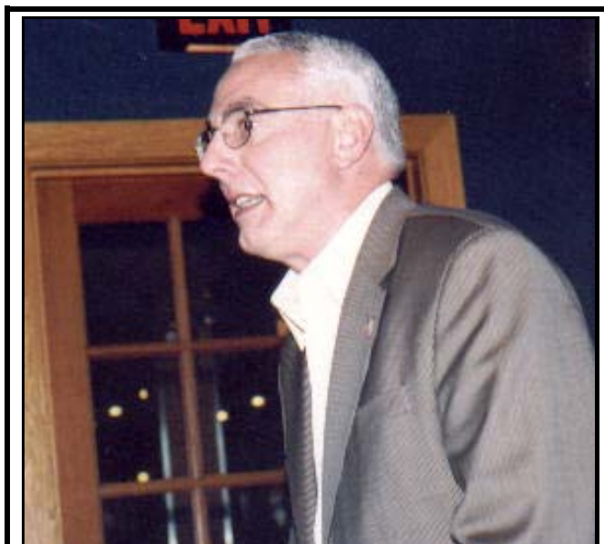
State Senator Steve Rauschenberger visits TAPROOT in his campaign for Republican nomination to the U.S. Senate.